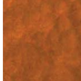
Canyon Red DE-02