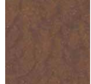
Antique Leather DE-03