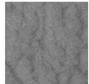
Black Pearl DE-11

All samples are close representations of the finished product and may vary slightly due to actual project conditions, finish texture and facility lighting. Final color selections and approvals should be made from actual contractor product samples.