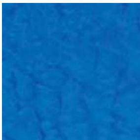
Metallic Blue DE-08