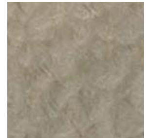
Marble Gray DE-07