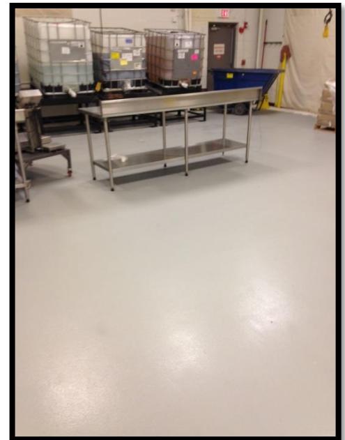
Bakery Floor After